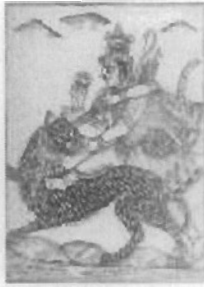
Shardhula hara murthy, God shiva with tiger skin