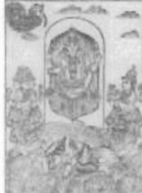
lingodbhava murthy, Form of God Shiva emerging from formless