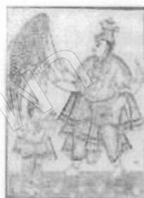
Matsya samhara murthy