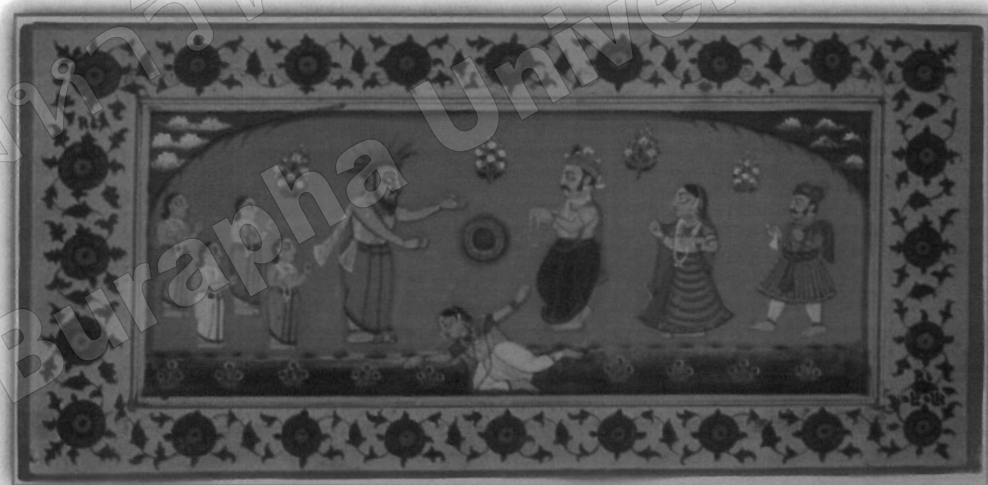
ภาพที่ 425 ฤๅษีทูรวาส