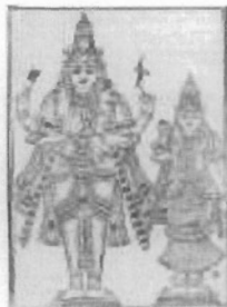
Chandrashekara murthy, ., God Shiva with crescent