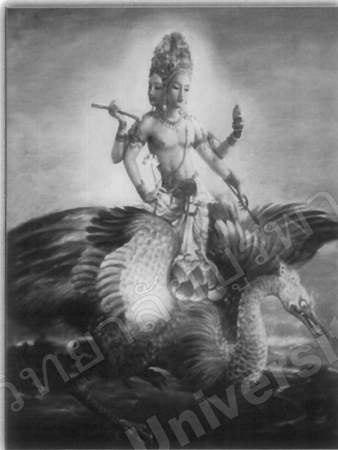
ภาพที่ 429 พระพรหม