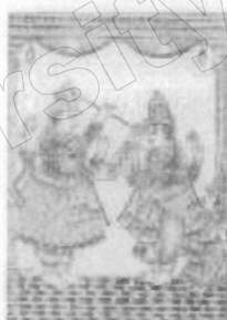
Raktabhiksha pradana murthy