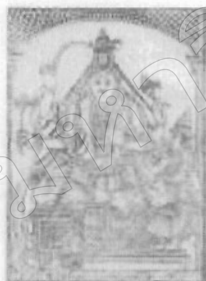
Gangavisarjana murthy, God shiva releasing ganga