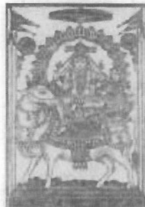
Vrishabharudar, God shiva on bull