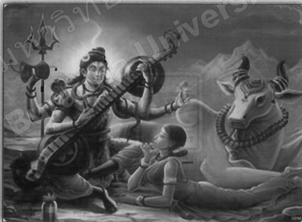
ภาพที่ 423 พระอีสานและพระสร้สวตี