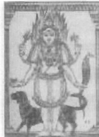
Kshetrapaala murthy, Bhairavar