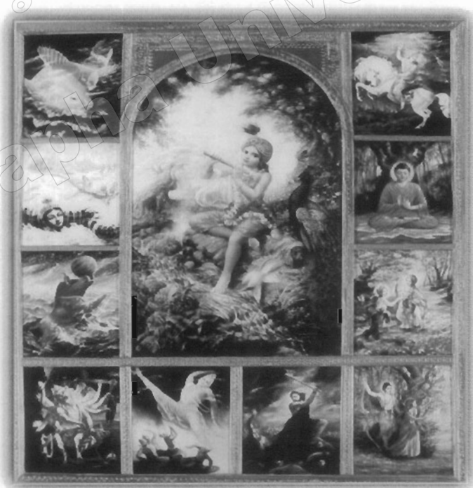
ภาพที่ 427 นารายณ์สิบปาง