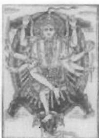
Qajasura samhara murthy, God shiva peeling elephant