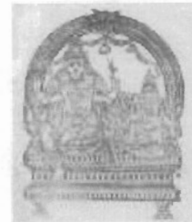
Somaskandha murthi, God shiva, Goddess uma and Lord skandha