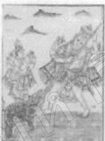
Varaha samhara murthy