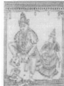
Sandhya nrita murthy