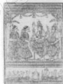
Kalyanasundhara murthy, Shiva partvati wedding