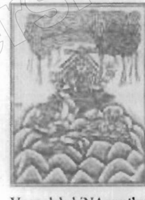
Voga dakshinamurthy, dakshinamurthy in yogic posture