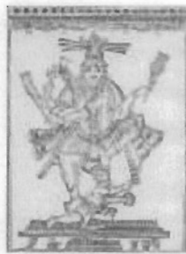
Bhujanga lalita murthy, God shiva with snake