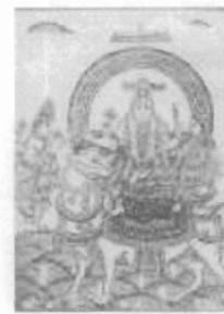
ChakradAnasvarUpa murthy, ,