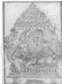
Maha sadAshiva murthy, God Shiva with twenty five faces