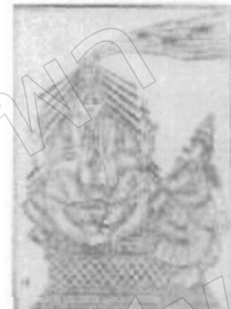
Gangadhara murthy, God shiva with ganga falling into matted locks