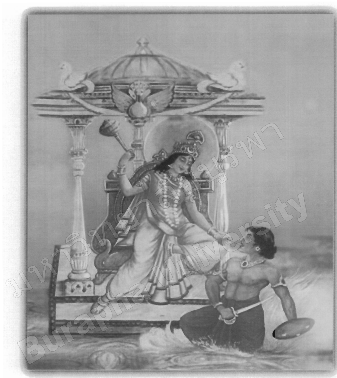
ภาพที่ 424 พระพกามุก