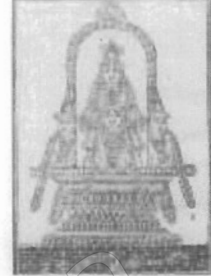
Mukhalingam, Linga form with five faces of god shiva