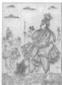
Kurma samhara murthy