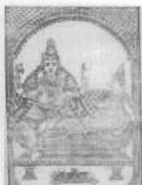
Gaurilila samanvita murthy