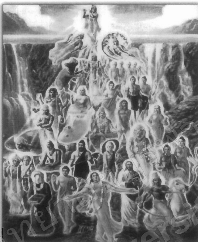
ภาพที่ 428 พระนารายณ์อวตาร