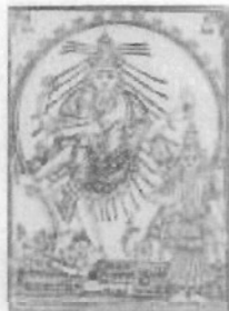
Sada nrita murthy