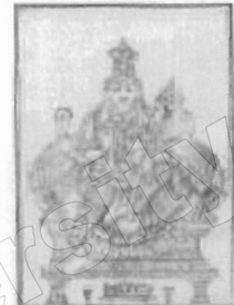
Umamaheshvara murthy, God shiva with Goddess uma