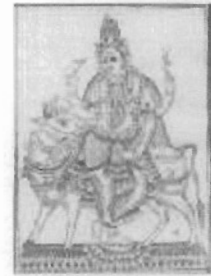
Vrishabhantika murthy, God shiva along with bull