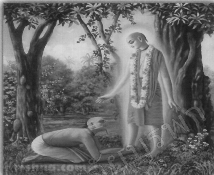
ภาพที่ 426 ภิกษุขัยจรรยา