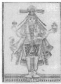
Bhujanga trasa murthy