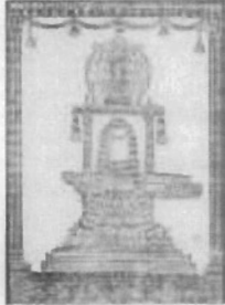
Linga murthy, God shiva in formless form