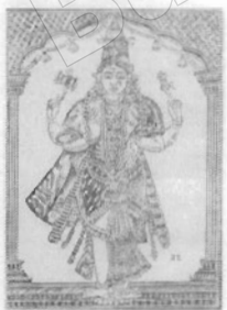
ArdanArishvara murthy, God Shiva Goddess shakti together in one form