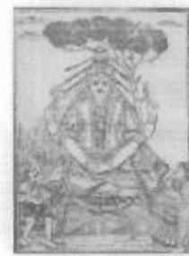
Kama dahana murthy, God shiva burning cupid